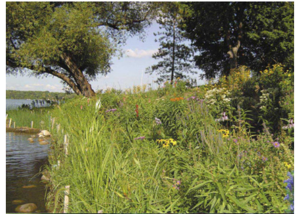
A natural shore.

The Lake Winnebago Quality Improvement Association recently submitted a grant application to the Fond du Lac Area Foundation to build a demonstration garden along the west shore of the Fond du Lac River near the mouth of Lake Winnebago. The demonstration project will be over 100 feet in length and contain over 200 plants.